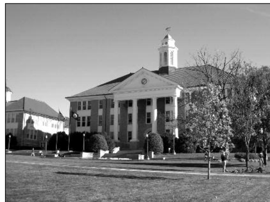
Wilson Hall, James Madison University