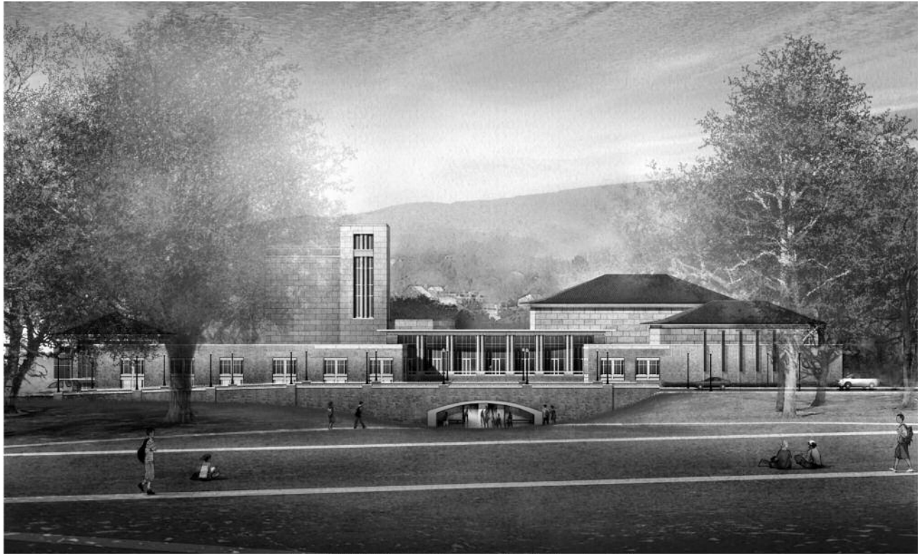
New 175,000 sf Forbes Center for the Performing Arts www.jmu.edu/performingartscenter/wm_library/brochure.pdf