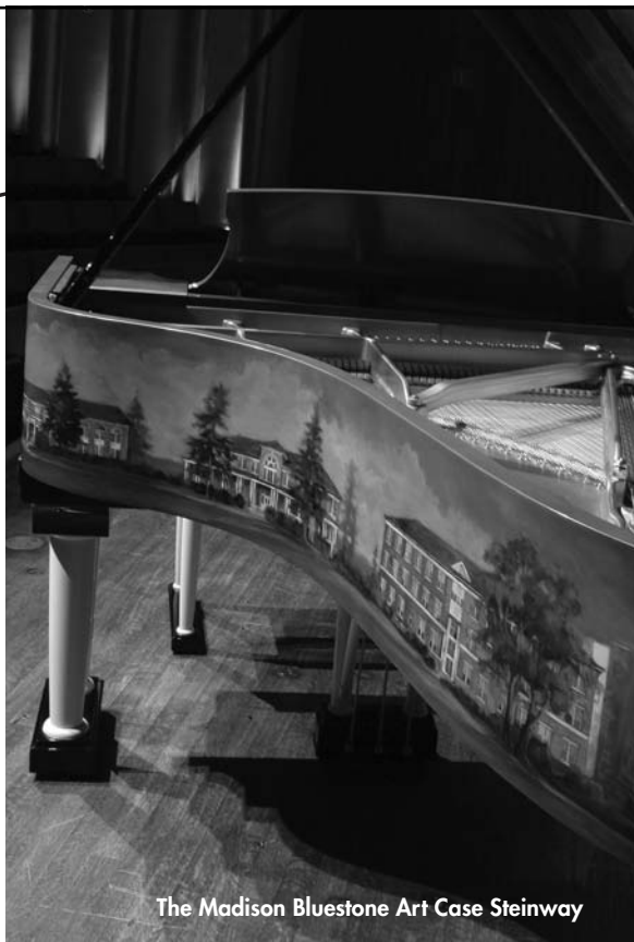
The Madison Bluestone Art Case Steinway