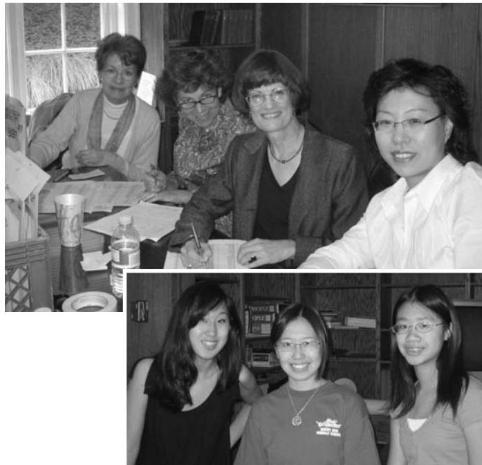
Excellent student pages and efficient auditors kept NVMTA's Fall Festival running smoothly on Nov. 10.

Visit VMTA's web site at www.music-usa.org/vmta